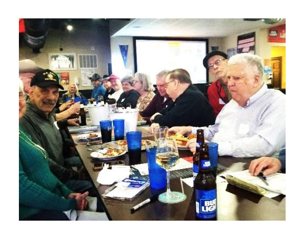
Super Bowl party